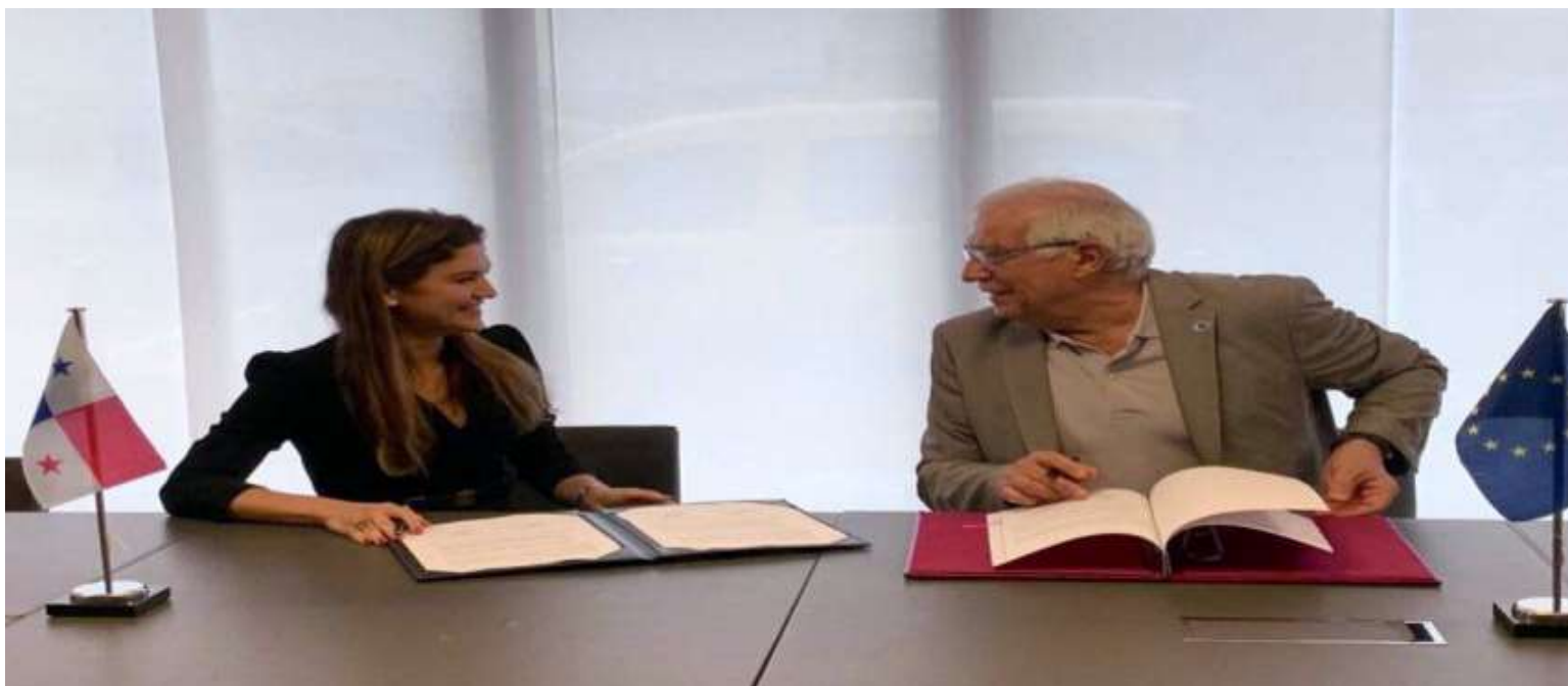
Panama's Foreign Minister, Erika Mouynes with Josep Borrell, High Representative of the EU for foreign Affairs and Security Policy.

Panama's Foreign Minister, Erika Mouynes, held several important ministerial meetings with her counterparts Sophie Wilmès, Jean Asselborn and Josep Borrell, respective heads of foreign policy of Belgium, Luxembourg and the European Union (EU) and senior official at the European Commission.